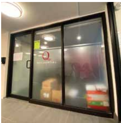
Standard Frosted Glass Vinyl