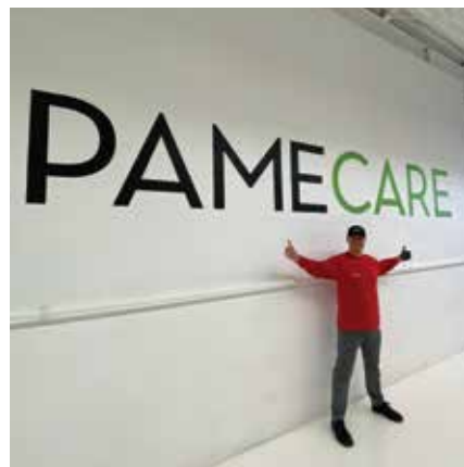
Large Die-Cut Wall Graphics