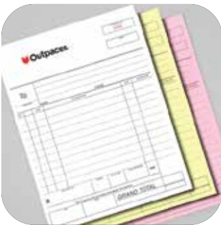
2, 3 and 4 Layer NCR Carbonless Forms