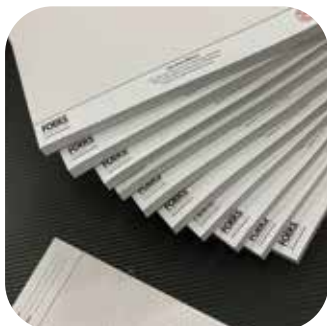
Custom Notepads Any Size, Color