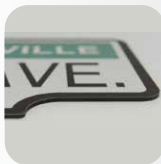
Alupanel Any Size or Shape