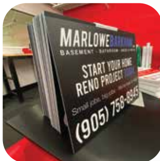
Weatherproof Coroplast Lawn & Fence Signs