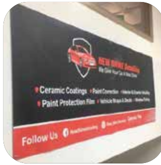
Banners 13/18oz Indoor/Outdoor Any Size