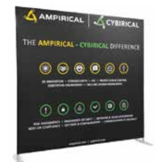
8x8 Fabric Banner Media Walls