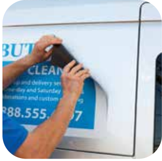
Laminated Car Magnets