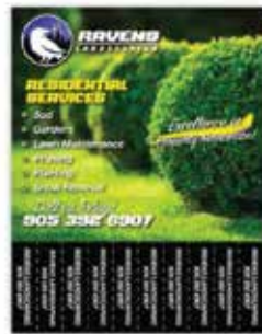
Gloss, Matte Flyers & Postcards