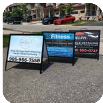
A-Frame Signs up to 32x48"