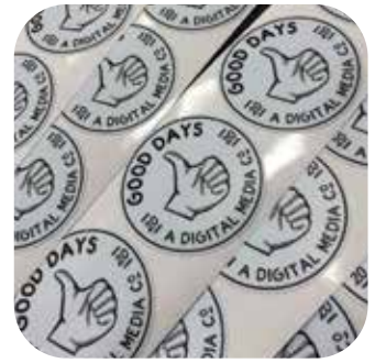
Vinyl Stickers & Labels Any Size or Shape