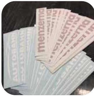
Die-Cut Decals with Transfer Tape