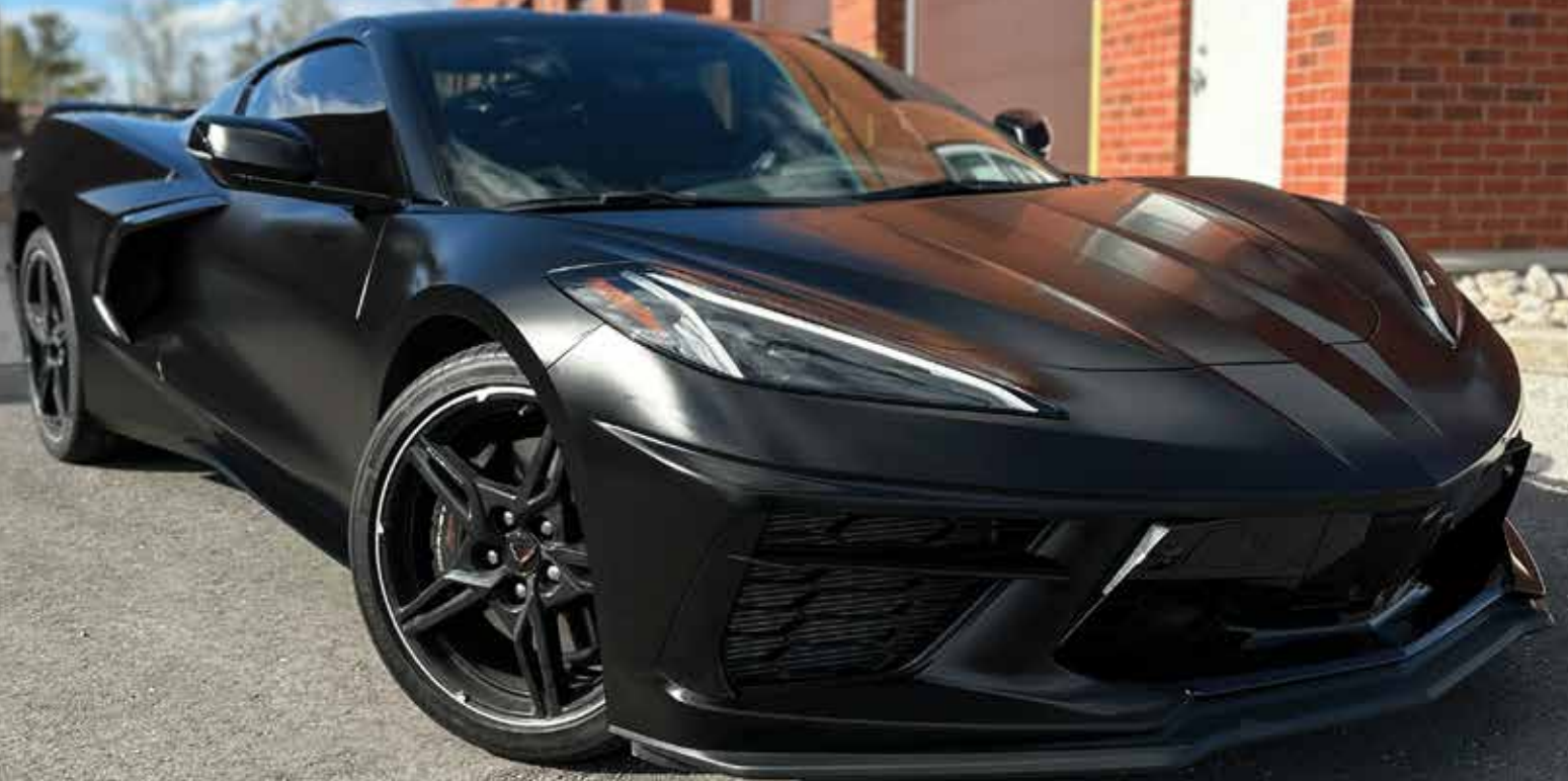
Shown: 2023 Corvette ZR1 wrapped in 3M Satin Black

OUTPACER DESIGN • PROTECT • WRAP • CREATE