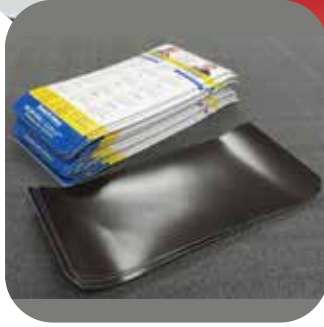
Fridge Magnet Any Size or Shape