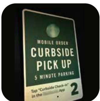
Reflective Outdoor Parking Signage