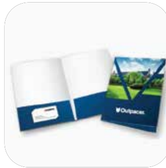
Presentation Folders with Business Card Slot