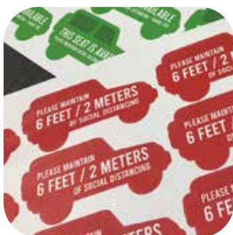
Floor Graphics & Directional Graphics