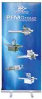
Banner Stands with Hardware