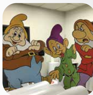
Custom Die-Cut Displays