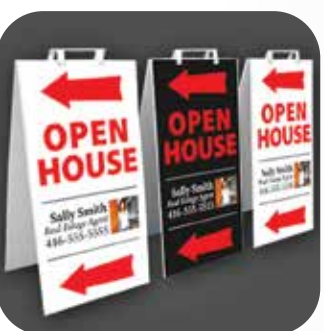
Crezone Sandwich Boards up to 32x48"