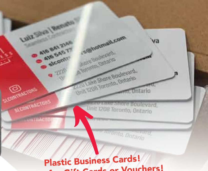
Plastic Business Cards! Great for Gift Cards or Vouchers!