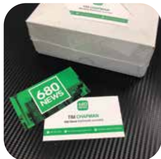
Specialty Finish Business Cards

Ensure consistent messaging with high quality, modern designs. We offer in-house printing and design for everything your business needs to look your best. Fast turnaround times on every product.