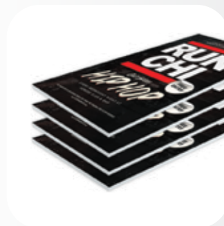
Foamcore Indoor Signage