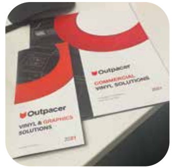
Booklets, Brochures Calendars