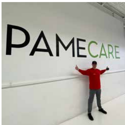
Large Die-Cut Wall Graphics