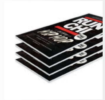
Foamcore Indoor Signage