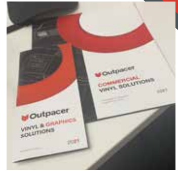
Booklets, Brochures Calendars

The little details matter! Let us redesign and improve your existing stationary - Designed and produced in-house for the best turnaround and value every time.