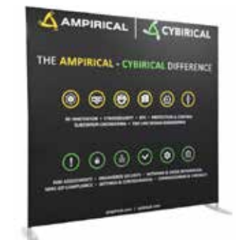
8x8 Fabric Banner Media Walls