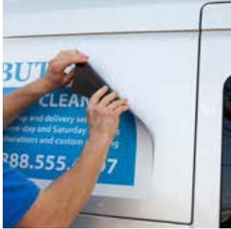
Laminated Car Magnets