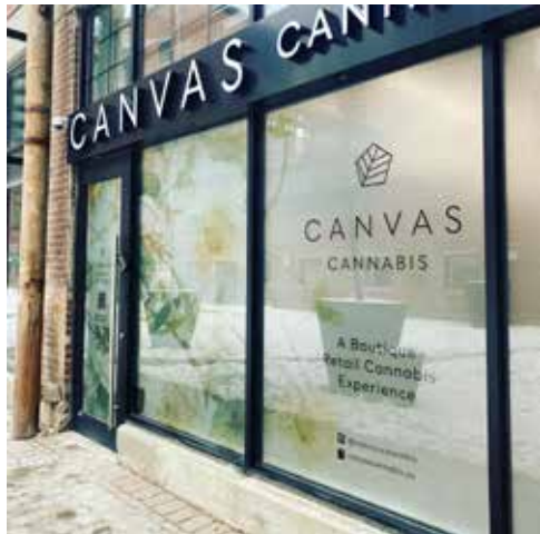
Printed Frosted Glass Vinyl

We've got a wide variety of interior and exterior sign products and solutions for all of your display needs.