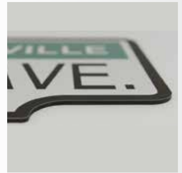
Alupanel Any Size or Shape