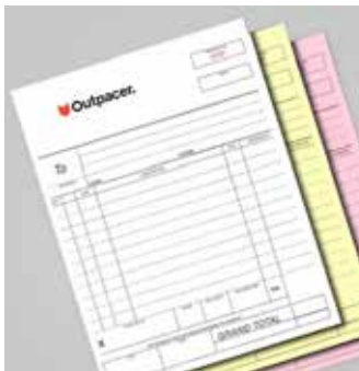
2, 3 and 4 Layer NCR Carbonless Forms