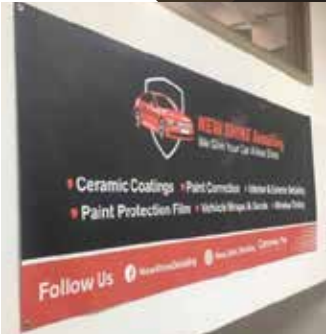
Banners 13/18oz Indoor/Outdoor Any Size