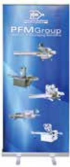
Banner Stands with Hardware