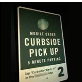
Reflective Outdoor Parking Signage