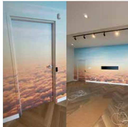
Wall Murals & Door Wraps