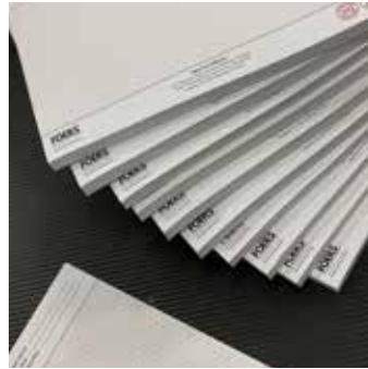
Custom Notepads Any Size, Color