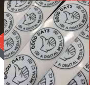
Vinyl Stickers/Labels Any Size or Shape