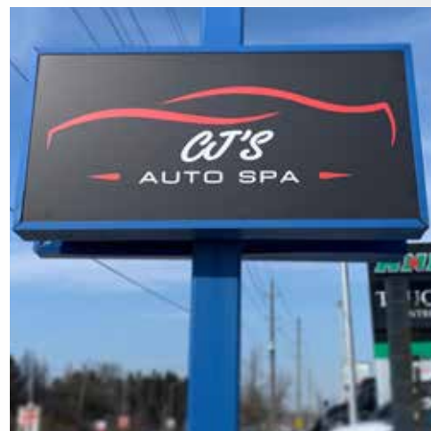
Transparent & Opaque Lightbox Signage