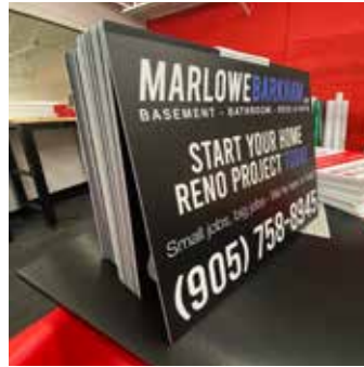
Weatherproof Coroplast Lawn & Fence Signs