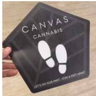
Floor Graphics & Directional Graphics