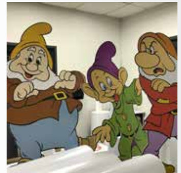
Custom Die-Cut Displays