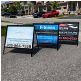
A-Frame Signs up to 32x48"