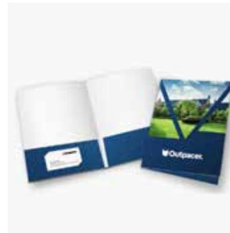
Presentation Folders with Business Card Slot