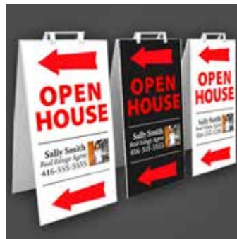
Crezone Sandwich Boards up to 32x48"