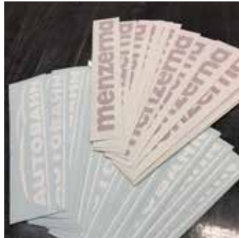
Die-Cut Decals with Transfer Tape