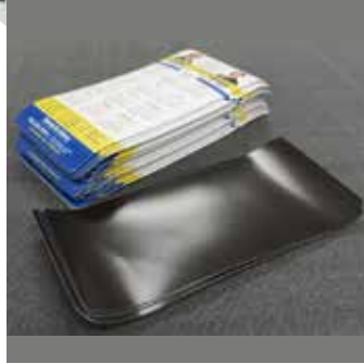
Fridge Magnet Any Size or Shape