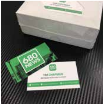
Specialty Finish Business Cards

Expertly designed and produced - All of your marketing and stationary assets can be quickly turned around by us.