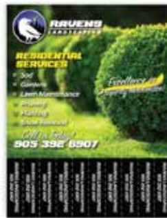
Gloss, Matte Flyers & Postcards