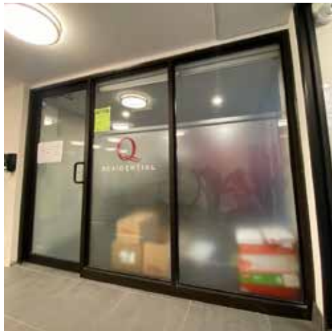
Standard Frosted Glass Vinyl